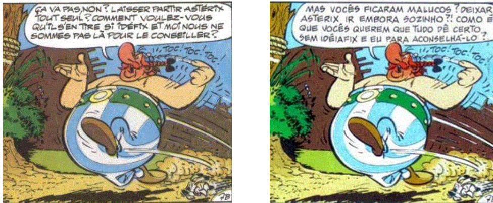
Fig. 2 – An image translated into word (Goscinnny and Uderzo, Chaudron, Caldeirão )

requires the hiring of a graphic artist. On the other hand, many readers buy the comics precisely because of their images, which are considered works of art.